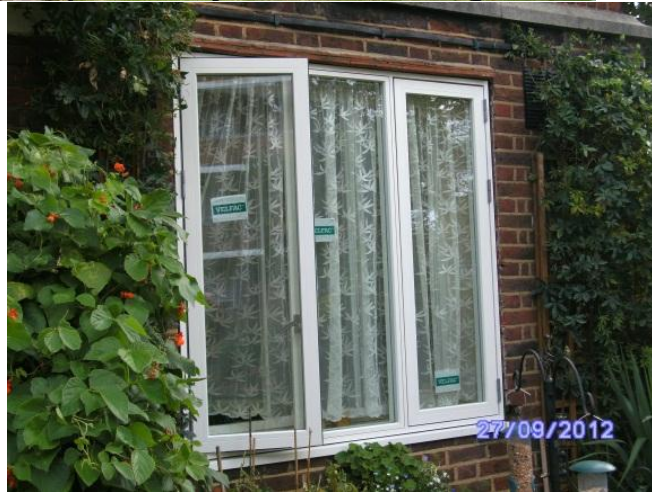
New sample window (aluminium clad timber double glazed) to the right hand lower ground floor flat.